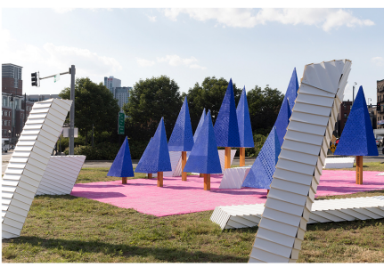
View of installation from public sidewalk.