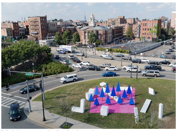
^ "Perfect" axonometric view of installation from adjacent parking